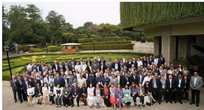
Group photo of all the representatives of Kreston International