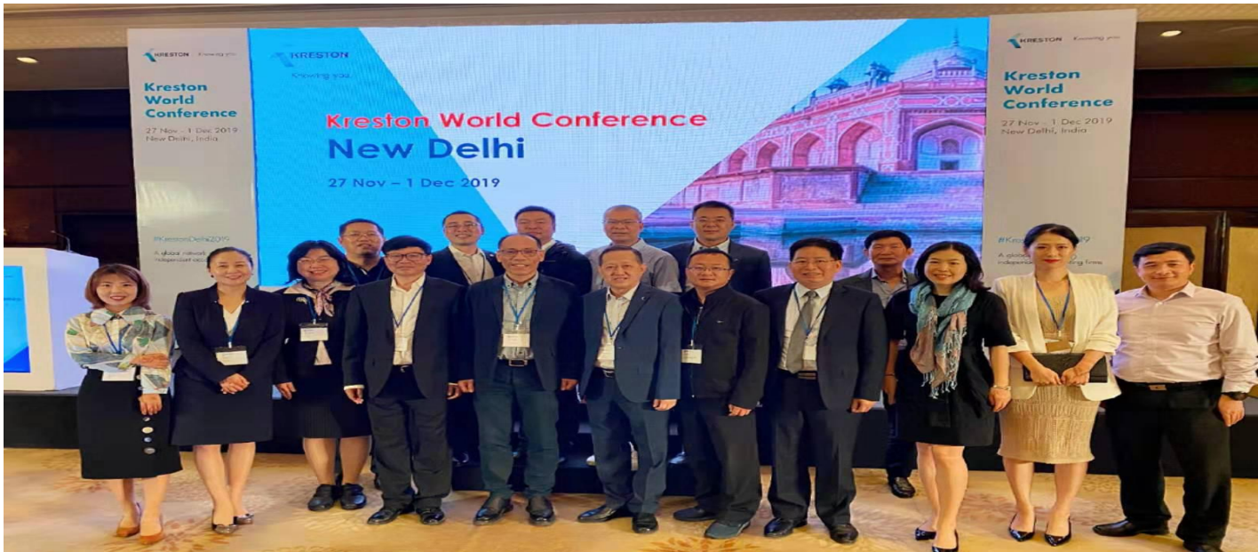
Group photo of Chinese delegation

Through this conference, Brighture received friendship and support from domestic and foreign counterparts and strengthened the confidence for internationalization. It is our firm belief that Kreston International and its member firms will have a more prosperous future.